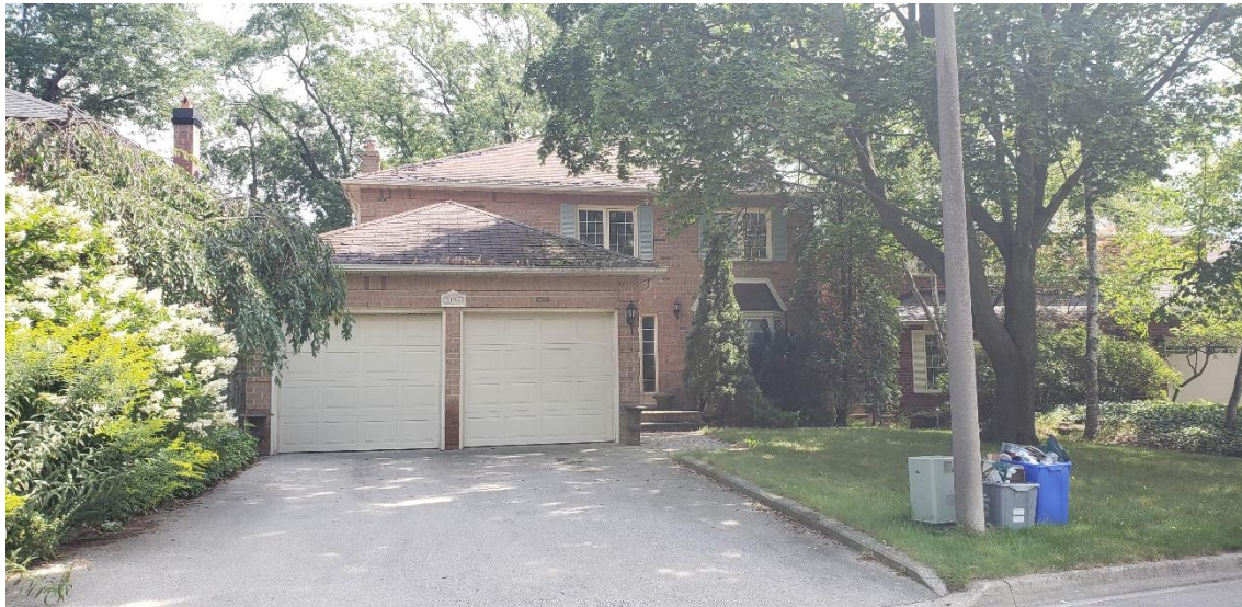
Photo of Existing Home