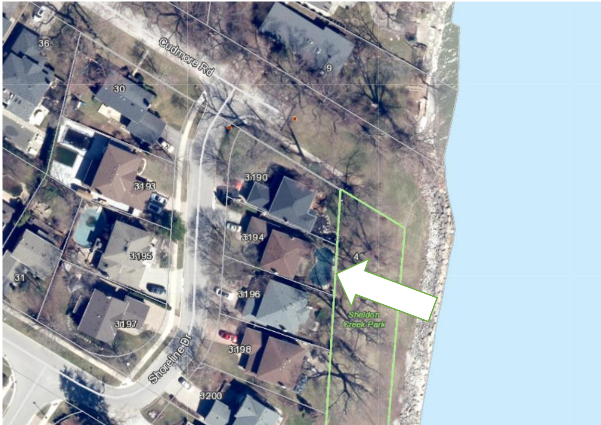
Figure 1 - Airphoto