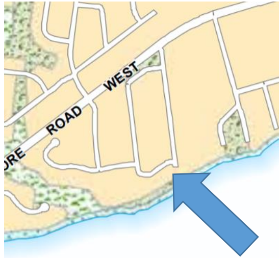
Figure 2 – Livable Oakville Plan

From the Zoning Bylaw perspective (Bylaw 201-014), the subject property is zoned RL3-0.