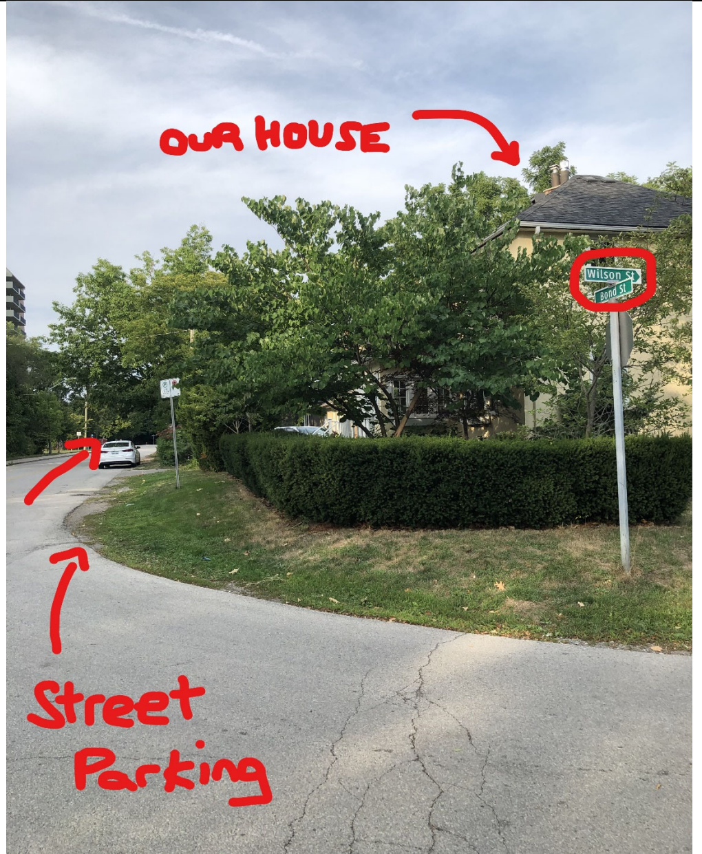
Our House – Corner of Wilson & Bond – Parking on the North Side of the Property